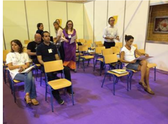
Participants of the Exploitation Workshop in Sevilla

PROJECT ELEVET FINAL CONFERENCE Final Conference of the EU project “ Electrical engineers vocational education transparency - ELEVET ” which was implemented under the Lifelong Learning Programme, was held on 19 th May 2014 in Warsaw.