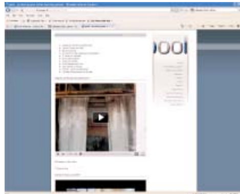
A view of the webpage with Portuguese videos

For each of the videos there will be a transcript and a translation into English to facilitate use of the material in e.g. blogs, Wordlink and the TextBlender.