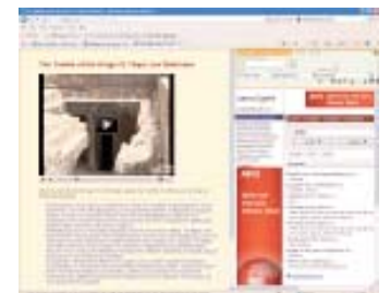
An exercises from Cyprus: The Tombs of the Kings

courses will be offered with modules from the pools-2 course guide. The course may be in-service courses, online courses, or blended courses. It is anticipated that most courses will be blended with an in-service start-up period matching a three days course followed by development of materials and exploiting theses in classes monitored and supported by the pools-2 course teachers.