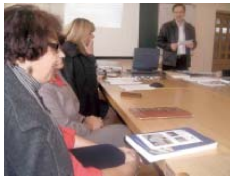
Pools-m brochures in action in Lithuania

Centre, there were almost all English language teachers from basic schools, gymnasiums, VET and Adult Education Centres. The teachers discussed about students' previous state exam results, activities and guidelines of methodology council for coming academic year.