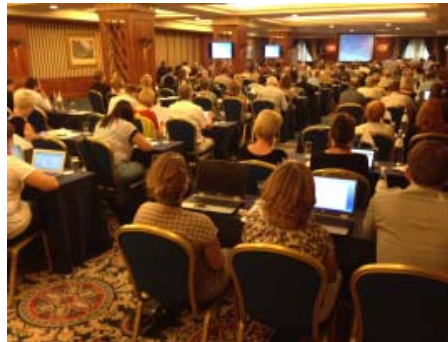
TOOLS Newsletters were placed on all chairs ready for the EfVET conference opening session