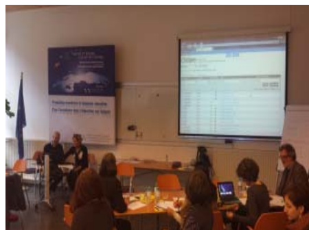
Users getting CLIL experience during a workshop in Graz

Her talk focused on "Enhancing the Foreign Language Learner's Experience through Clilstore" and addressed issues such as the need to help learners in technical contexts learning languages for specific purposes to acquire personal and professional skills among which the ability to communicate efficiently in a foreign language is included. The session participants were impressed with Clilstore's ability to store an increasingly growing repository of ready-made online didactic units which are freely available to the language learning and teaching community at large.