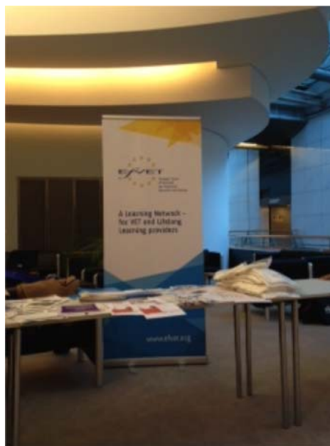
EfvET, one of the Methods partners displaying information on the project in the European Parliament

ETI will be participating and is a member on the POOLS METHODS and CLIL4U projects over 2014-2016.