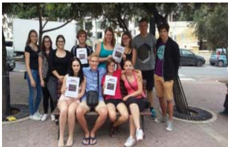
Happy students with their International Work Placement Portfolios in Malta

Just after the official end of the METHODS project the Slovenian team from Srednja šola za gostinstvo in turizem Celje had the opportunity to exploit the METHODS results in 3 mobility flows within the Erasmus+ KA1 project. In October 2015 the students from 6 Slovenian catering and tourism schools were using the International Work Placement Portfolio (IWPP) during their internship in Malta.