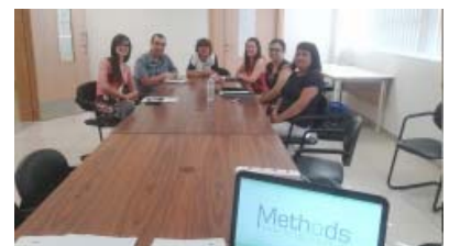
Volunteer teacher training course at MCAST! Well done all participants what great sessions.

The METHODS project has been funded with support from the European Commission. This publication reflects the views only of the author, and the Commission cannot be held responsible for any use which may be made of the information contained therein.