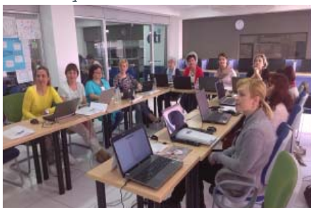
Teachers from six Slovenian schools attended the one week intensive course »Using CALL for CLIL« implemented by our METHODS partner ETI Malta

We are very optimistic regarding the implementation of the future projects because our school has just been awarded the Erasmus+ Mobility Charter in VET.