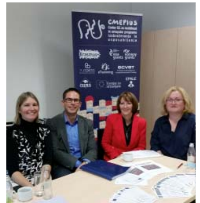
Dissemination of the Methods, International Work Placement Guide and Portfolio at the event "Creative breakfast"

Just before the end of the project - our "LAST MINUTE" dissemination of the Methods, International Work Placement Guide and Portfolio at the event "Creative breakfast" organized by the Slovenian National Agency CMEPIUS for enthusiastic project coordinators from all regions of the country.