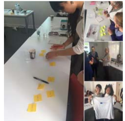
The Methods project final workshop in Sweden! Teachers from Folkuniversitetet and Studiefolket learned about the PhyEmoC method.