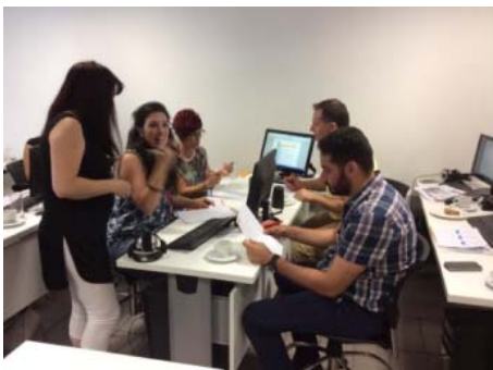
Participants from the first face to face part of the CLIL Main course.

team has run the first face to face main course workshop with a group of 25 people among whom there were teachers of both primary and secondary technical education, as well as educators from Vet colleges. The seminar was a big success and we are currently expecting the participants' feedback about the course presented. Meanwhile the Cy team has proceeded the development of two new scenarios relating to Office Administration and a third and final one relating to Culinary Arts. These scenarios have also been adapted and translated into Greek.