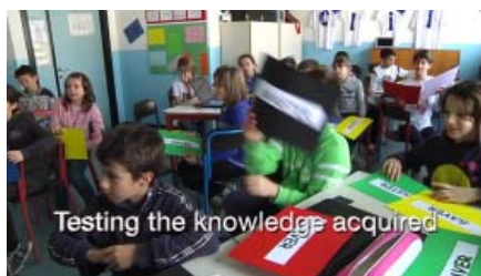
From a CLIL lesson in a primary school class in Bussero, Italy

Clil4U has finalized six videos that show pupils/students learning a subject through a foreign language. The videos serve as demonstrator of six CLIL scenarios, but also act as promotion / awareness raising material for the CLIL method and motivation for learning foreign languages. The videos can be watched individually or as one 14 minutes long video, they are available with texts in Danish, English, Greek, Italian, Maltese, and Spanish. In the last 30 days the videos were watched more than 700 times. Watch the videos from http://languages.dk/clil4u/#videos