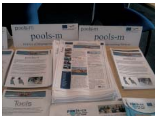
POOLS-M materials on display during the Eurocall conference

After the positive reception given to Part 1 of the SUPSI video show-casing 3 of the POOLS-M methods (Task Based Learning, Computer Assisted Language Learning, PhyEmoC) applied to both English and German language classes at our University, now that the new academic year has started we are planning to complete Part 2 of the video, which we hope to bring to Lithuania with us. Lesson plans for the two final methods (Simulation and E-tandem) will be designed in the next few weeks, with a view to completing the filming in October. The format will be the same, as will the video producer, so that the 2 Parts can be combined making one single video (projected length 15 minutes)