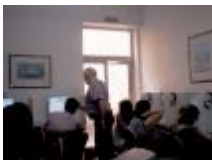
Pools members in action across Europe