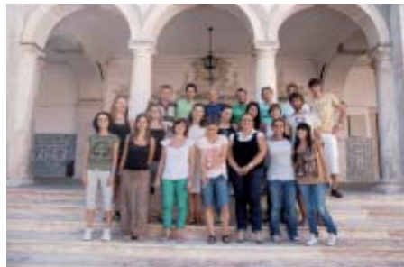
Portuguese pilot course participants

You can learn more about pools-2 from its Facebook page or from www.languages.dk