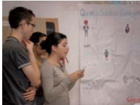
Italian secondary school students experiencing the pools-m methods

"schacciata" (a particular kind of Tuscany bread), meat, vegetables, cheese. The purpose was to be able to collect all the information required from the exercise in an hour. Then, following the directions given to them by the teacher at the beginning of the exercise, they had to meet again in the center of the city. The students had a great time, and after the initial embarrassment of having to talk to people they didn't know they liked this activity, realizing how it would be useful for their future purchases.