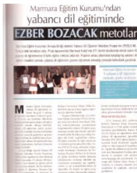
Article in the PLUS EDUCATION magazine

gain a distinctive feature among the most distinguished educational institutions as far as Language Teaching is concerned. As it is known, there is a big gap in terms of providing a stable Language Teaching Policy in the Ministry of Education. Every year we can see many decisions taken in order to elevate the standards of Language Teaching. But unfortunately nothing is set in concrete so as to shape and raise the standards of language teaching policy in Turkey. But now, thanks to the POOLS-M project the questions "Why can't we teach English to our students?" and "Why can't our students speak English?" will be removed considerably and they will remain as a thing of the past.